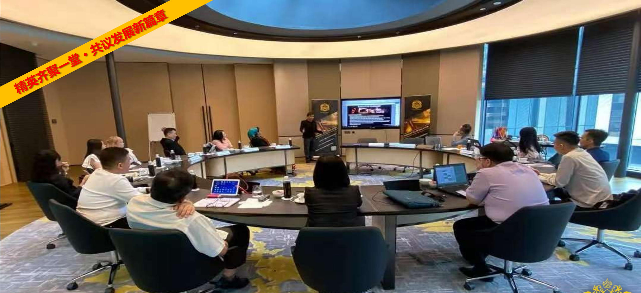
The Annual General Meeting was held in conjunction with attendees including founder, president, the auditor, legal advisor, and members of the executive committee.